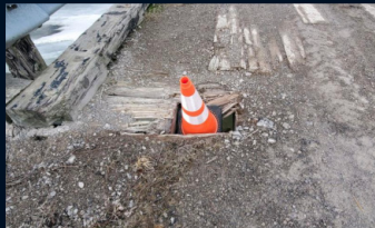
Weir Gate Bridge damage at the Shiawassee State Game Area